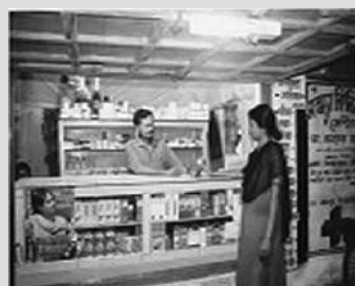
In Sundarbans, entrepreneurs now generate more income because stores with electric lighting can stay open later